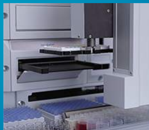
The DSX's robotic arm moves microplates and pipettes all samples and reagents.